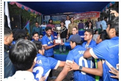
The final match of the Inter-College Cricket Tournament Page-3