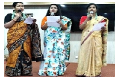
Rabindra Jayanti Celebration Page-3