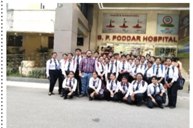
Hospital visit programme: Page-3