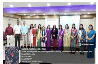
Women's day celebration: A Gender Sensitisation programme Page-4