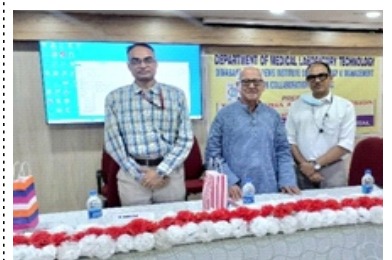
Thalassemia awareness & screening programme: Page-4